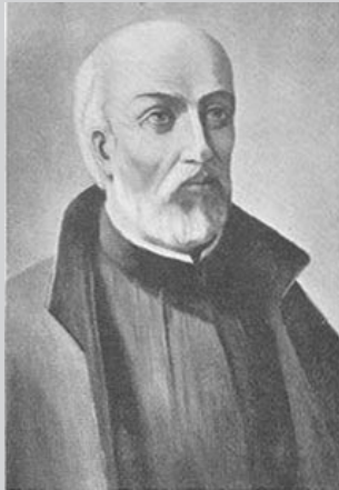
St. John de Brebeuf